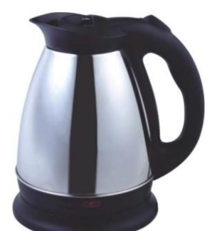
Cutlery, cups, dinner wear